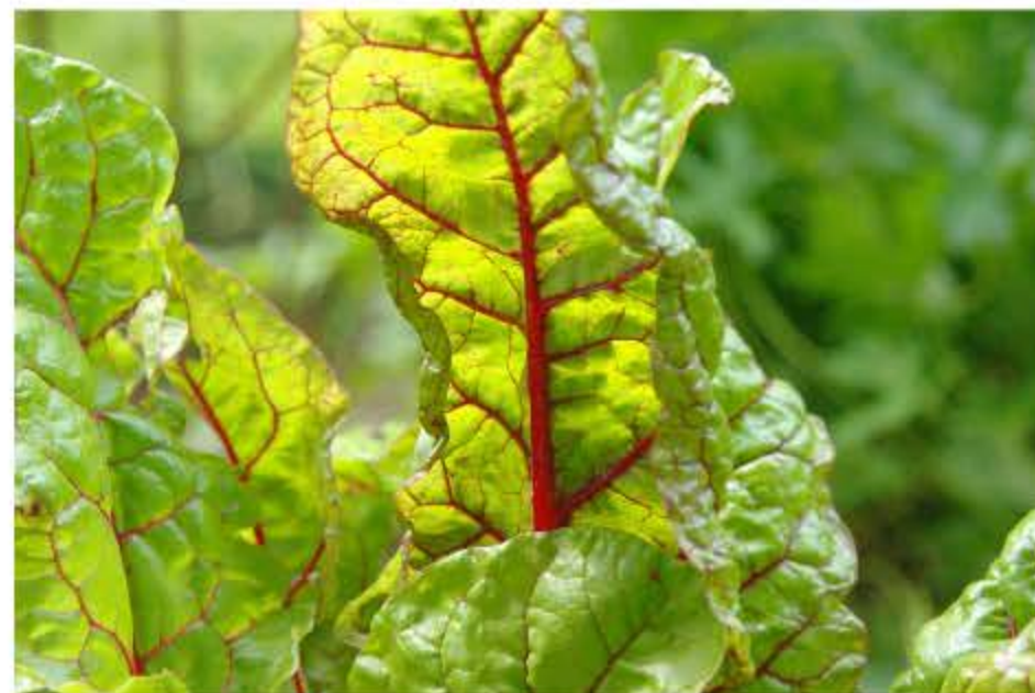
Red Swiss Chard